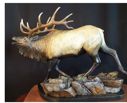
BURL JONES Mountain Music, 20 L x 15 T x 8" W, Bronze JULY 5 & 6