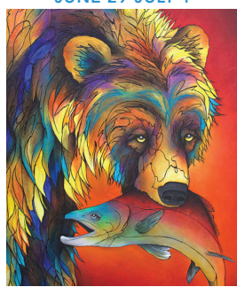
MICQAELA JONES Fishing Stories, 36 x 48", Acrylic JULY 13 & 14