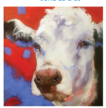
LINDA ST. CLAIR Black Baldy Blues, 16 x 16", Oil JULY 13 & 14