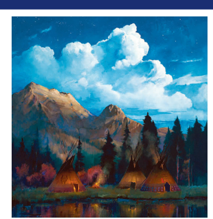
COLT IDOL River Side Reflections, 48 x 36", Oil JUNE 22 & 23