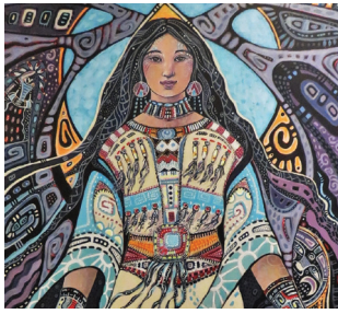
CHRISTY MCKAY The Return, 24 x 48", Acrylic on Board AUG 24 & 25