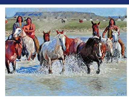
JOHN GAWNE Camp at Square Butte, 18 x 36", Oil JUNE 22 & 23