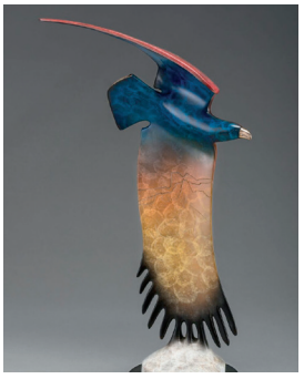
REBECCA TOBEY Equinox, 20 x 11 x 2 x 6" Bronze Ed. of 30 JUNE 29-JULY 1