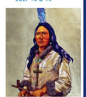
ECHO UKRAINETZ One Feather, 24 x 30", Batik AUG 24 & 25