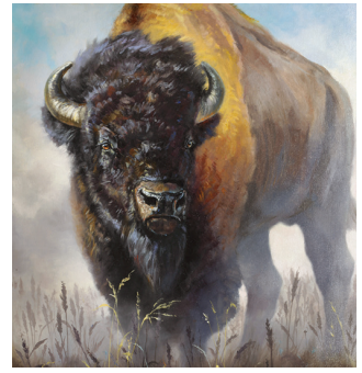
JENNIFER JOHNSON Yellowstone Vintage Bison, 36 x 24", Oil JULY 5 & 6