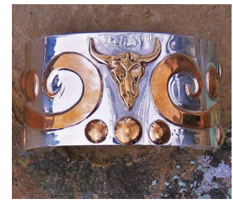
DAVID SANFORD Cuff, Sterling Silver and Pink Bronze AUG 24 & 25